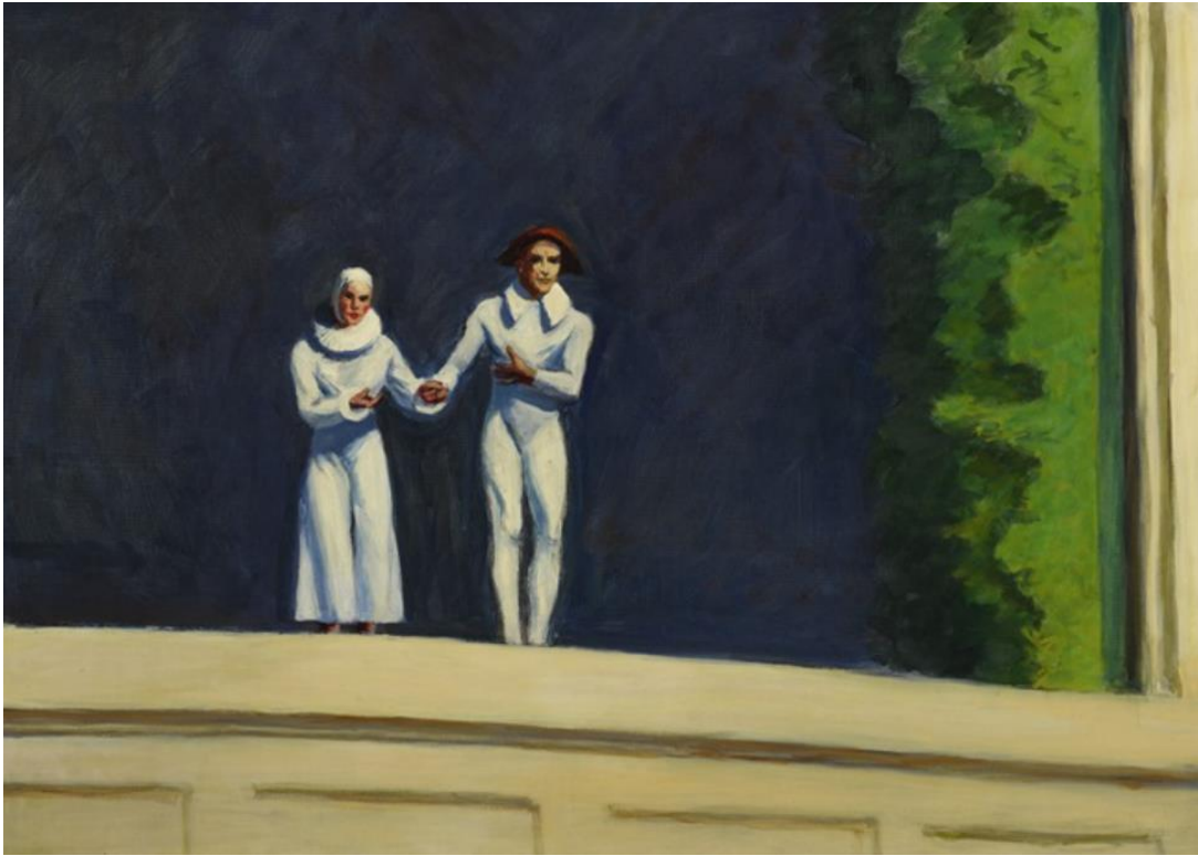
Fig 7. Hopper, E. Two Comedians (1966) Oil on canvas. 29 x 40 in.