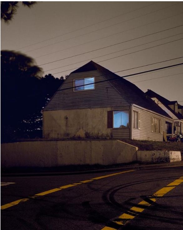
Fig 5. Hido, T. #2133 (1998) Chromogenic print. 38 x 30 in.

Nighthawks (1942) (Fig. 4) was completed just days after America's entry into World War II. Which further contextually divides the two worlds of Hopper's bleak, devoid psyche, and the fruition of chaos in the real world. I do not believe it reflects existential dread, more hopelessness. A direct reflection of the war Hopper and his wife were in whilst both feeling totally isolated, even in a marriage. There was so much strife and fighting on the surface level; however, deep in his subconscious he felt truly alone, even though she was always there as a model in the paintings. There is such isolation that even the chaos of the outside cannot touch the inexplicably loneliness Hopper feels inside himself and inside these imagined places.