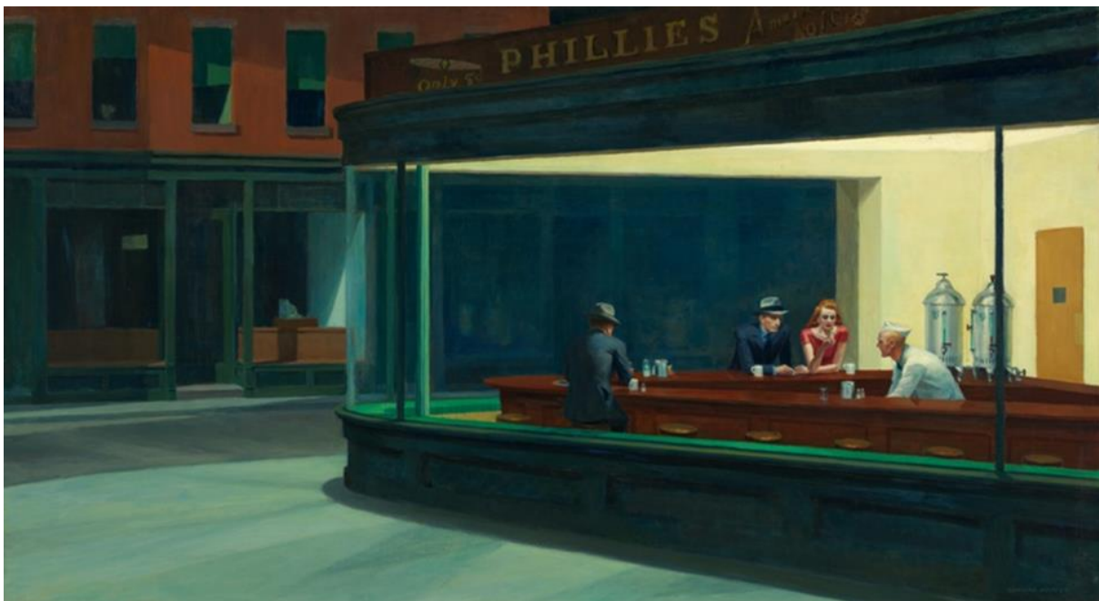
Fig 4. Nighthawks (1942) Oil on canvas. 33 x 60 in.

As a viewer of the artwork and literature I am studying, I feel this element of shame Sartre references. I have no choice but to take a back seat whilst assuming the role of the viewer. I exist in reality, whilst viewing these pieces of work that take one to an unreal, liminal space. Especially in Hopper's work, as people we have lived in opposite environments; and this inference of loneliness within these isolated architectural rooms, leaves the viewer to take on the new role of an outsider; I am not invited.