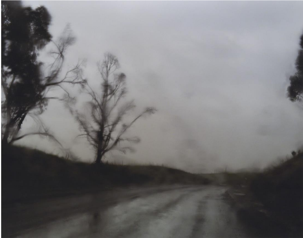
Fig 2. Hido, T. Untitled #7552 (2008) Chromogenic print mounted to aluminium. 20 x 24 in.