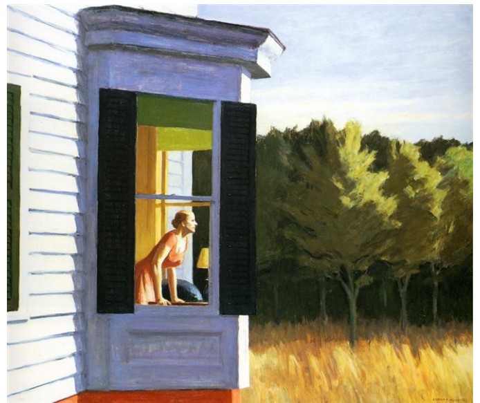
Fig 6. Hopper, E. Cape Cod Morning (1950) Oil on canvas. 40 x 34.5 in

There is a parallel of voyeurism in both Hido's and Hopper's scenes. They indulge in the intimacy of viewing a woman alone, hotel rooms, or strangers' homes at night, all of which are heterotopias and private spaces. Although there is an absence of human warmth in both