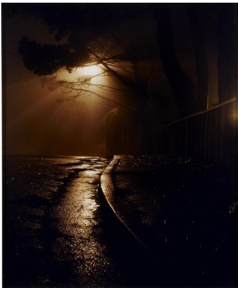
Fig 1. Hido, T. Untitled #2256-A (1999) Chromogenic print. 24 x 20 x 1 in.

Todd Hido's impressionistic Untitled #2256-A (1999) (Fig.1), is the impression of his return to spaces reminiscent of childhood memories, birthing this liminal impression of the crossover between both time and memory in the form of a photograph.